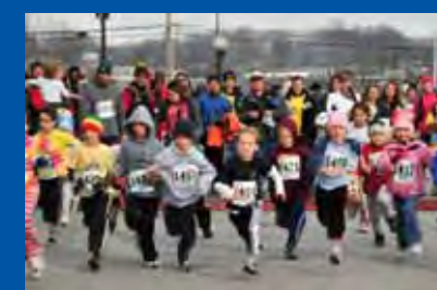
BRIAN'S RUN Annual 5K, Benefiting Homes For Our Troops & Camp Joy