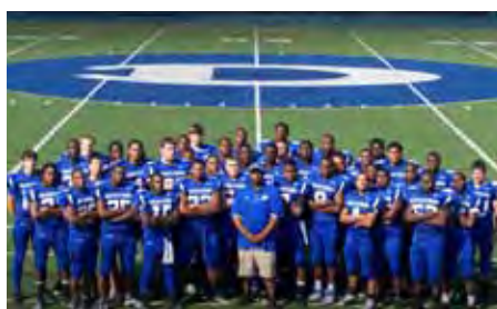
2010 Dover High School Football