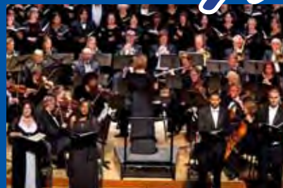
KENNETT SYMPHONY Sponsored Beethoven Concert Series