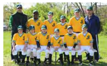
2010 Brandywine Little League