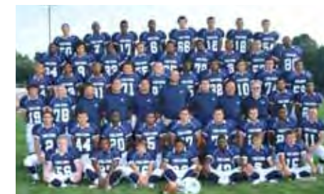
2010 Pottstown High School Football Team