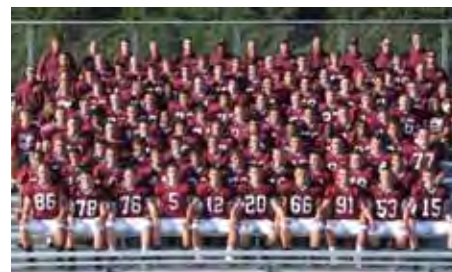
2010 Garnet Valley High School Football Team