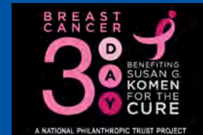
BREAST CANCER 3 DAY 3 Day, 60 Mile Walk, Benefiting Susan G. Komen For The Cure