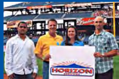
PHILLIES PHESTIVAL Annual Autograph & Auction Party, Benefiting The ALS Association