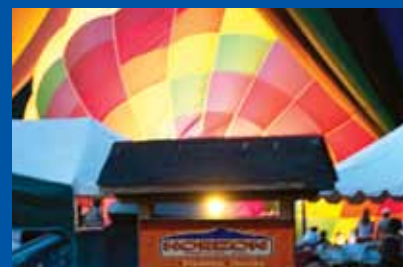
CHESTER COUNTY BALLOON FESTIVAL Hot Air Balloon & Music Festival