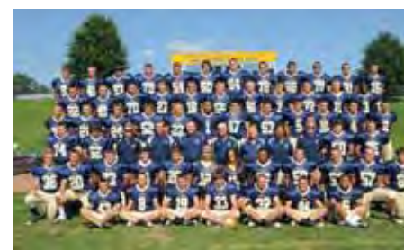
2010 Salesianum High School Football Team