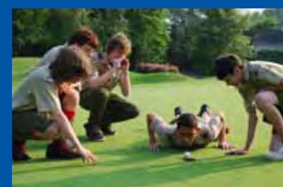
RICHIE ASHBURN CLASSIC Golf Classic, Benefiting the Cradle of Liberty Council, Boy Scouts of America