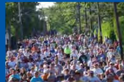
KENNETT RUN Annual 5k/10k, Benefiting Kennett Run Charities, Inc.