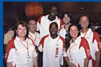
JIMMY ROLLINS BASEBOWL Celebrity Bowling Tournament, Benefiting the Arthritis Foundation