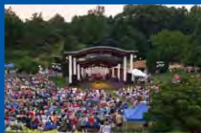
DELAWARE COUNTY ROSE TREE SUMMER FESTIVAL Admission Free Concert Series